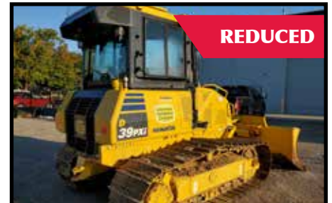
2018 KM D39PXi-24 Stock #U37404, Intelligent iMC Dozer, 1,553 Hours $160,000