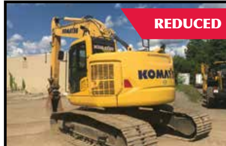
2014 Komatsu PC228USLC-10 Stock #U34649, Cab, AC, Coupler, Bucket, 2,399 Hours $150,000