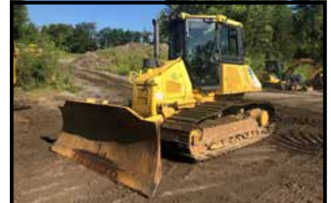
2013 KM D51PX-22 Stock #K10744T, Cab, A/C, PAT Blade, 5,153 Hours $99,000