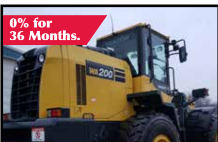
2017 Komatsu WA200-8 Stock #U38332, Coupler, Bucket, Certified, 1,385 Hours $129,000