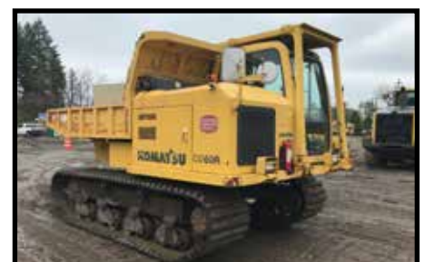
2010 Komatsu CD60R-1 Stock #U28806, Cab, A/C, Heat, Revolving Bed, 3,936 Hours $90,000