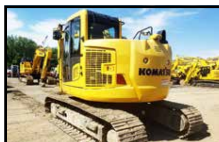
2017 KM PC138USLC-11 Stock #RDK10530T, Cab, A/C, 24" TG Pads, Hyd Coupler, 1,055 Hours $129,000