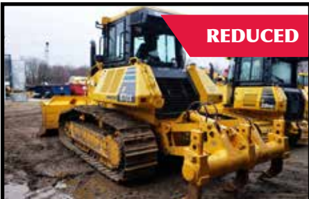
2016 Komatsu D61EX-24 Stock #U37319, Cab, A/C, Multi Shank Ripper, 2,195 Hours $195,000