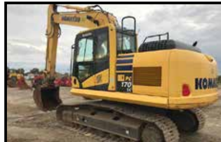
2015 KM PC170LC-10 Stock #U34497, Cab, A/C, Aux Hyds, 24" TG Pads, Coupler, 3,426 Hours $104,000