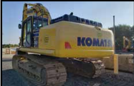
2016 KM PC360LC-10 Stock #U34239, SG Pads, 2 Way Hydraulics, Coupler, 2,664 Hours $235,000

For a Complete List of Used Equipment, Please Visit www.columbusequipment.com