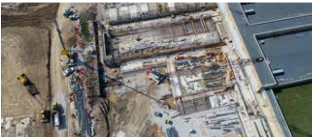
With a working radius of 190 feet, the 110-ton Link-Belt 218 HSL commands access to the entire, active work zone at the company's $55-million Collins Park Water Treatment Plant Basins 7 & 8 Project.